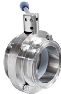
Fluorine-lined manual butterfly valve