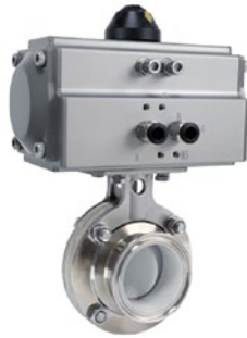
Pneumatic quick-loading fluorine-lined butterfly valve