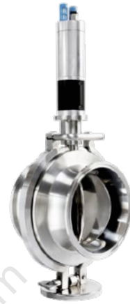
Double-V Dosing valve